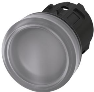
Indicator lights, 22 mm, round, plastic, clear, lens, smooth