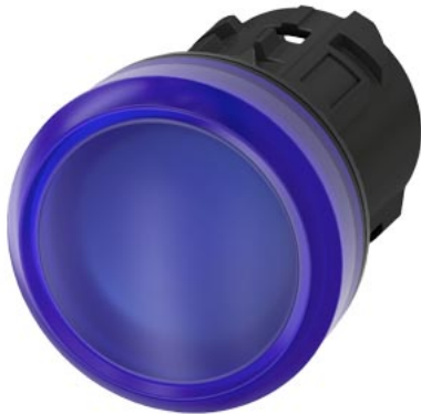
Indicator lights, 22 mm, round, plastic, blue, lens, smooth