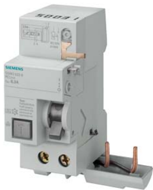
RC unit for 5SL4, 2-pole, type AC, In: 40 A, 30 mA, Un AC: 230 V