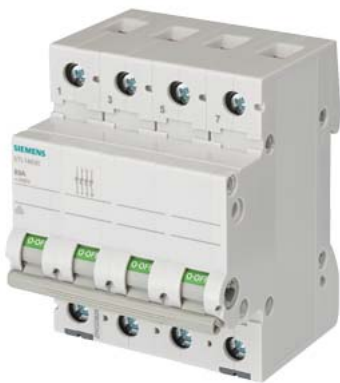
off switch 100A 4-pole