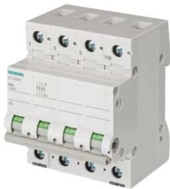
off switch 63A 3-pole+N