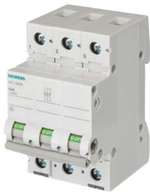
off switch 40A 3-pole