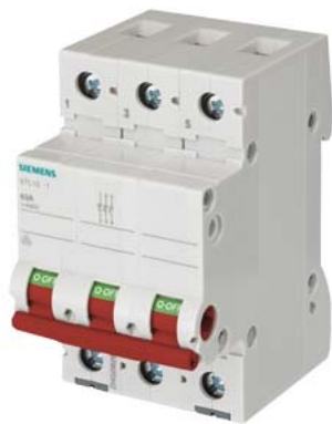
off switch 63A 3-pole, with red handle