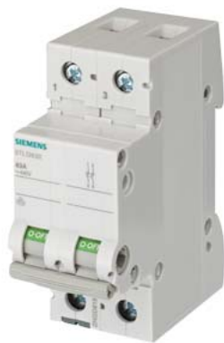
off switch 63A 2-pole