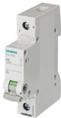
off switch 40A 1-pole