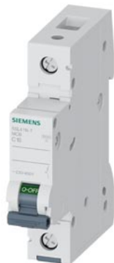
Miniature circuit breaker 230/400 V 10kA, 1-pole, C, 16A