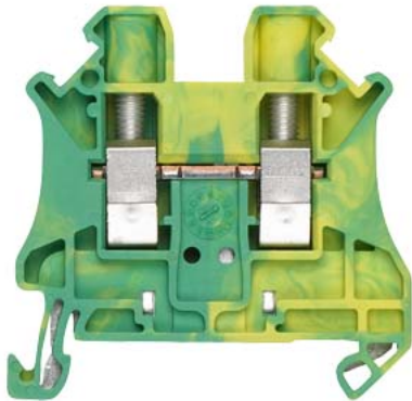
Terminal, screw terminal, PE/PEN terminal, 6 mm 2 , green-yellow