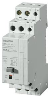
Remote control switch with 2 NO contacts, with central ON/OFF function Contact for 230 V AC, 400V 16A Control 24 V AC