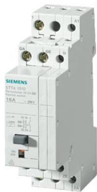
Remote control switch with 2 NO contacts, Central and group switching Contact for 230 V AC, 400V 16A Control 230 V AC