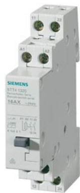
Remote control switch with 2 NO contacts, series Contact for 230 V AC, 400V 16A Control 12V AC