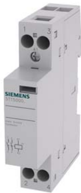
INSTA contactor with 2 NO contacts Contact for 230 V AC, 400V 20A Control 24 V AC