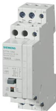
Remote control switch with 1 NO contact, and 1 NC with central ON/OFF function Contact for 230 V AC, 400V 16A Control 230 V AC