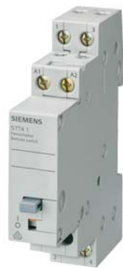
Remote control switch with 2 NO contacts, Contact for 230 V AC, 400V 16A Control 230 V AC