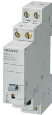
Remote control switch with 2 NO contacts, Contact for 230 V AC, 400V 16A Control 115 V AC