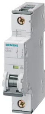
Miniature circuit breaker 230/400 V 6kA, 1-pole, B, 20 A, D=70 mm