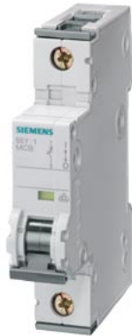
Miniature circuit breaker 230/400 V 6kA, 1-pole, B, 10A, D=70 mm