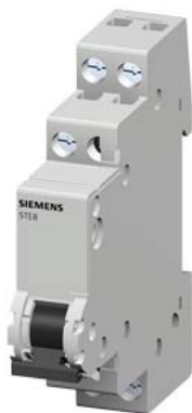
OFF switch 20 A 1 NO