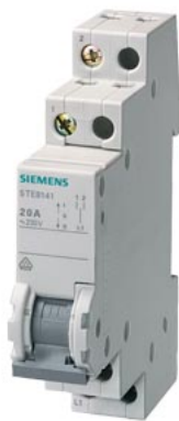
Group switch 20 A 2 groups