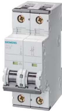
Miniature circuit breaker 230 V 10kA, 1+N-pole, D, 25A, D=70 mm