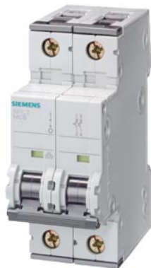
Miniature circuit breaker 230 V 10kA, 1+N-pole, B, 20 A, D=70 mm