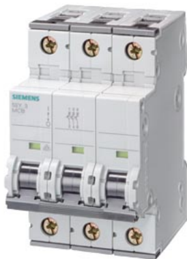
Miniature circuit breaker 400 V 10kA, 3-pole, C, 20 A, D=70 mm