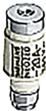
NEOZED fuse-link, D01, 16 A, gG, Un AC: 400 V, Un DC: 250 V, with tin-coated contact-caps