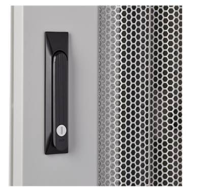
Swing handle wave vented front door