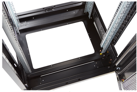
Large base entry