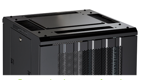
Four-way brush entry roof panel