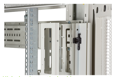
High-density vertical cable management